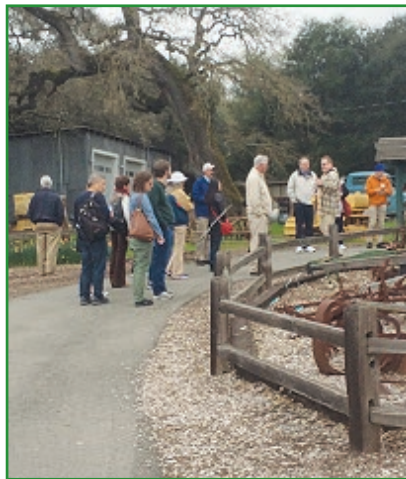
Touring Forest Home Farms

The popularity of the program and feedback from class members has changed the course length to 8 weeks in order to accommodate additional sessions. The extra two sessions will allow time for presentations by the San Ramon Valley Fire Protection District and to discuss economic development in the City. Other classes will include an overview of the Administrative Services, General Government, Parks, Planning, and Public Works departments.